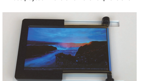
Video playback with the tablet size