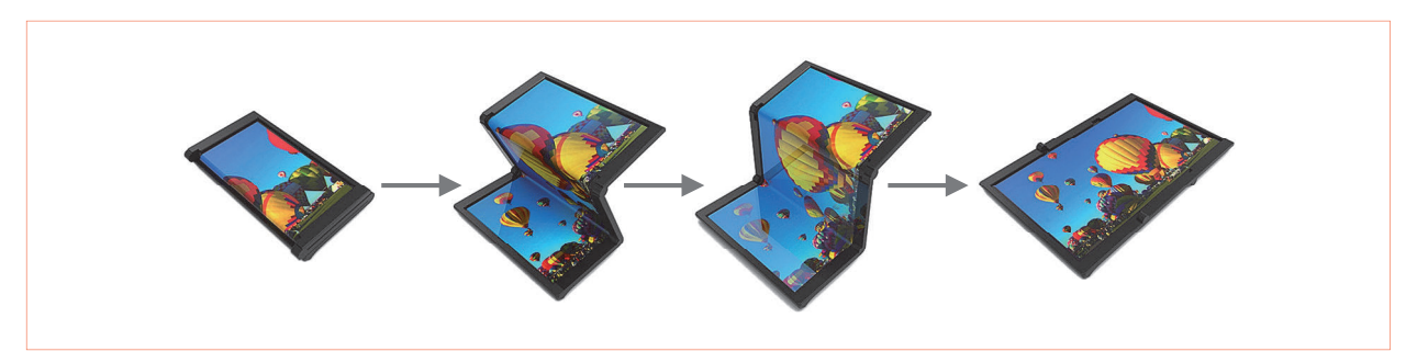
Figure 1 Tri-fold type