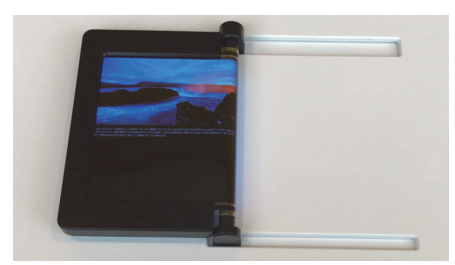
Video playback with the normal smartphone size