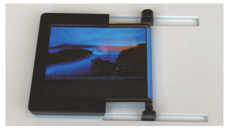
Content size adjusted to extended display size