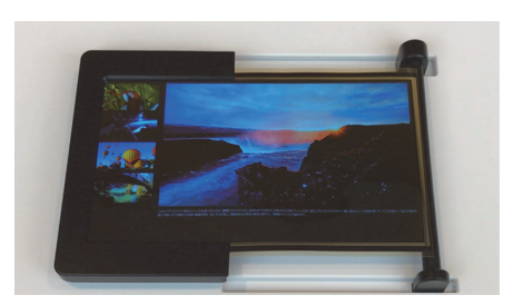
Layout changes in further extended display size. Includes complementary content (links) on the left of the main content