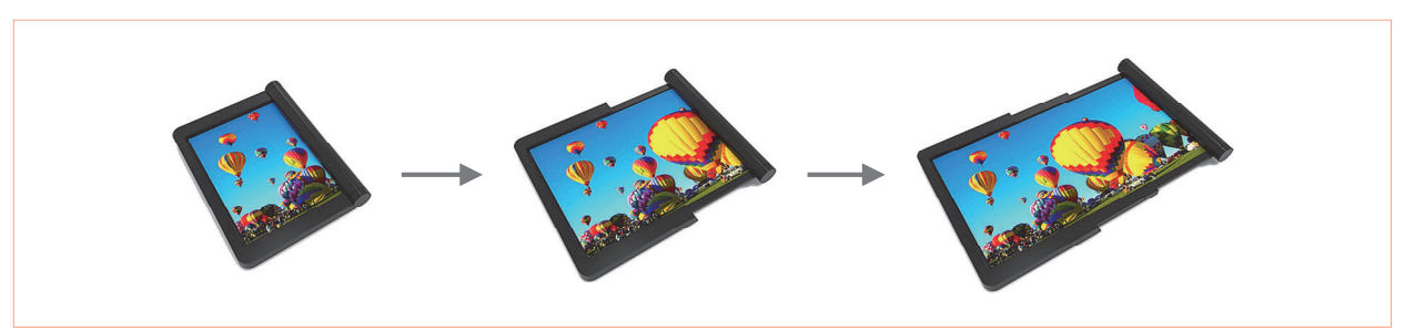
Figure 2 Rollable type