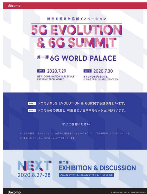
Figure 1 Part 1 website information

March 2020, 5G is expected to drive the creation of new services and help find solutions to social problems in a variety of fields. Here, to respond in a flexible manner to a wide range of requirements that differ from field to field, further enhancements to 5G will be needed. At the same time, discussions on 6G have already begun in Japan and other countries aiming to launch commercial services around 2030. To this end, studies are being conducted on