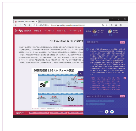
Figure 3 Part 2 screenshots of text chat system

augmentation and Virtual Reality (VR), brain technologies, regional revitalization, radio/network technologies, and space. Passionate discussions ensued on each of these themes and on expectations for 6G. In addition, many viewers were able to watch these panel discussions online and ask questions and give comments using a chat system, which made for