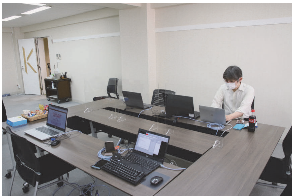
Photo 3 Part 2 back office (answering questions from inside/outside NTT DOCOMO)