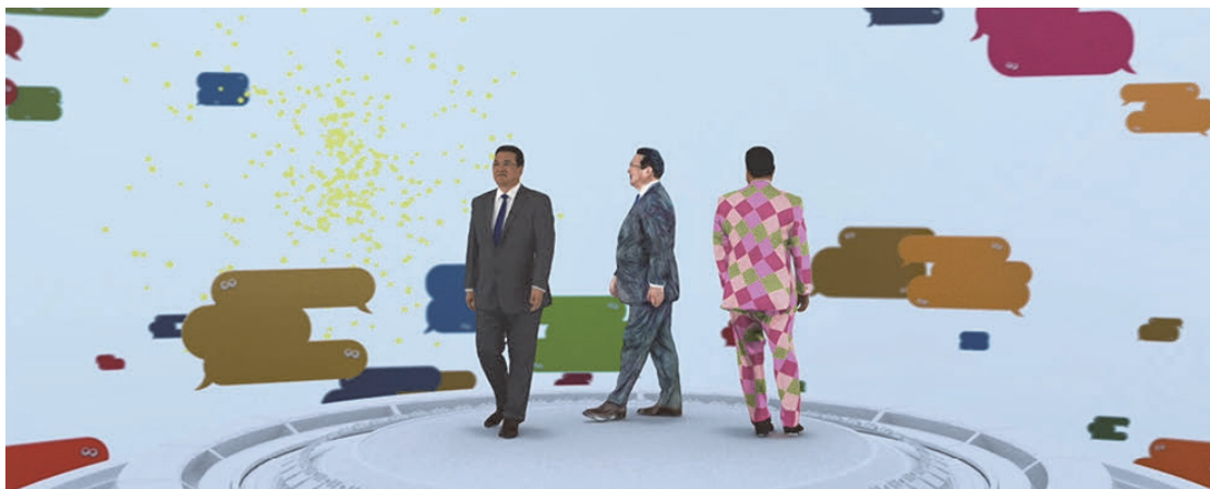
Figure 3 Welcome speech