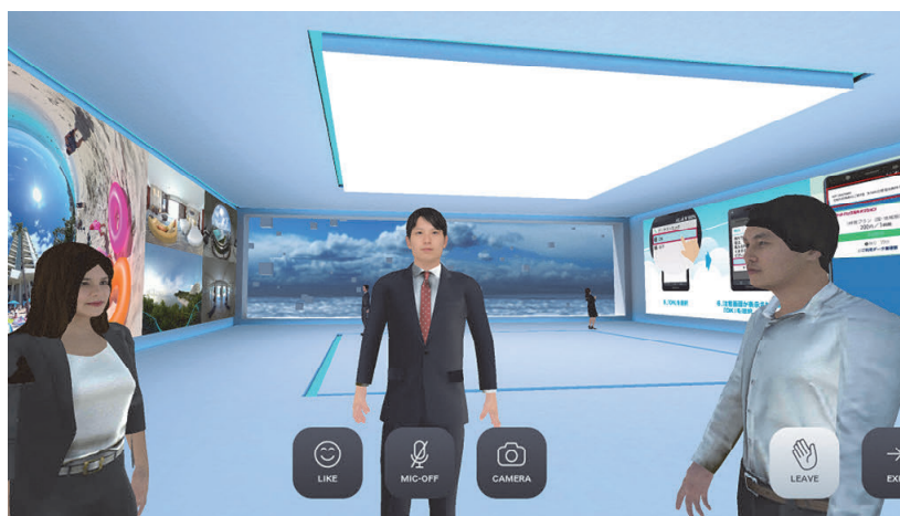
Figure 5 Main booth of Virtual Booth