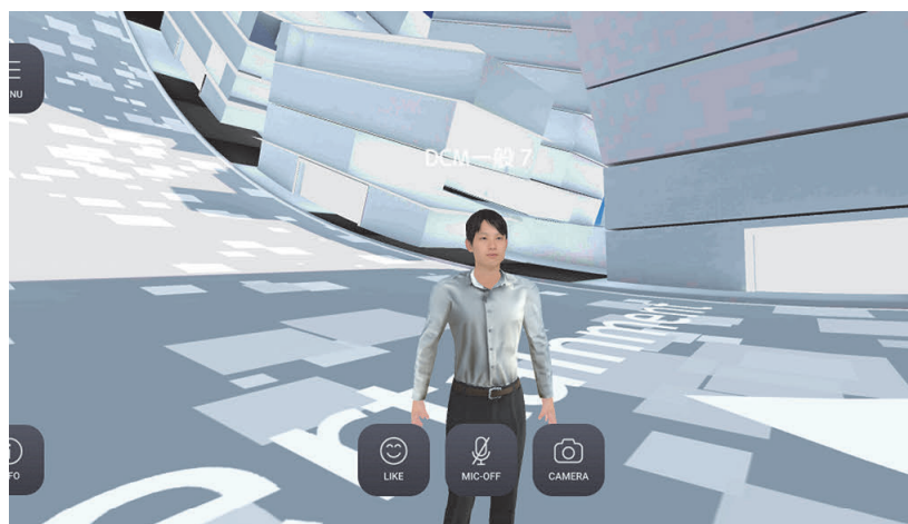
Figure 4 Virtual Booth

In this Virtual Booth, volumetric video technology delivered rich and realistic limited-edition content via a smartphone app of 3D productions adding objects and models, etc., to images of celebrities and badminton players (Figure 5). This technology not only faithfully reproduces 3D models of people and objects photographed from all angles using special equipment in VR space, but also digitizes