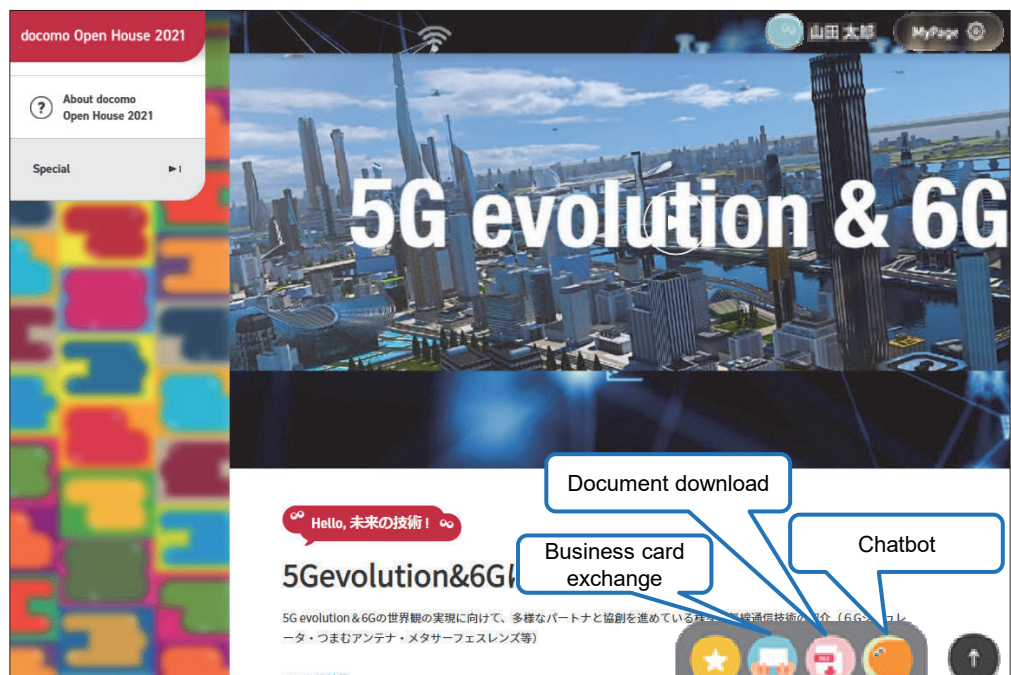
Figure 2 docomo Open House 2021 Tech Showcase