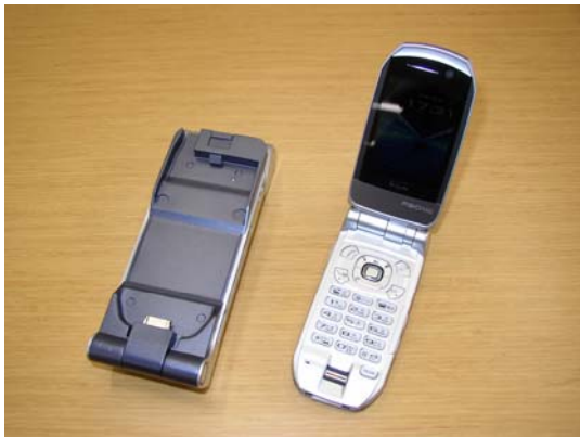
Mobile phone and fuel cell