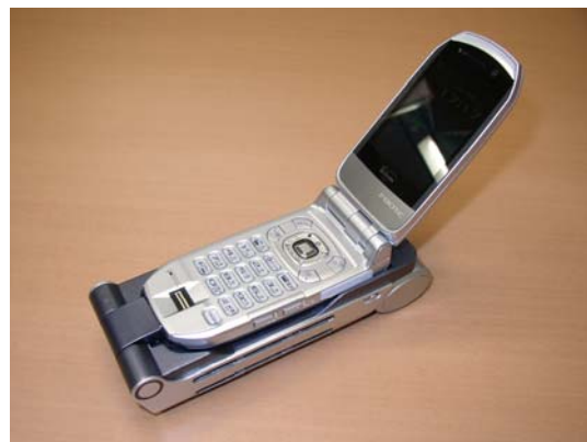
Mobile phone attached to fuel cell